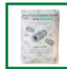
001-3663 Diatomaceous earth