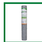
018-2304x Poultry netting