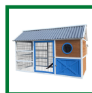
001-7654 Chicken coop