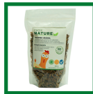
079-4604x Dried grub treats