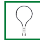
Carbon fiber bulb

Carbon fiber bulb 001-5983 600 W 001-5984 900 W 001-5985 1200 W 001-5986 1500 W