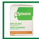
039-8385 Wood shavings

Carbon fiber bulb 001-5983 600 W 001-5984 900 W 001-5985 1200 W 001-5986 1500 W