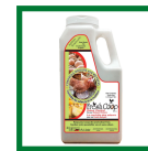
063-5781 Odour control