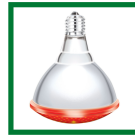
061-8623 PAR38 175 W Pkg of 2