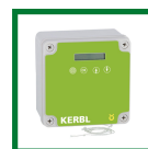
001-2734 Door motor