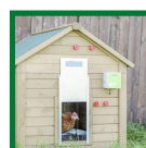
001-2735 Sliding door

For more informations on the products, consult www.bmr.ca