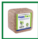
001-9434x Peck block