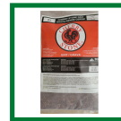
001-4534 Stone grit