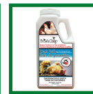
063-5790 Dust bath