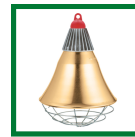
061-5167 1 intensity