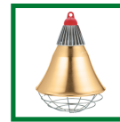
061-7855 2 intensities