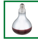
065-0902 BR40 250 W Pkg of 2