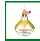
001-5980 1 intensity 11 3/4 in.