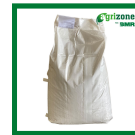
001-3760 Haying feed