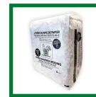
001-3024 Paper shavings